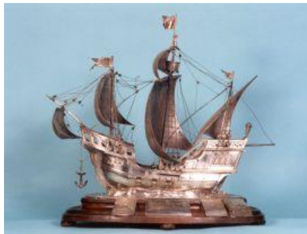
Original King of Spain Trophy

Boat Launching, Berthing & Storage: Competitors are invited to use the dry storage, hoists and assigned docks at CYC during the event, subject to applicable CYC guidelines and protocols. For information and arrangements regarding boat storage immediately preceding and following the event, contact the CYC Dockmaster.